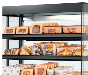
Food (literally) in the spotlights - LED lighting above each shelf.